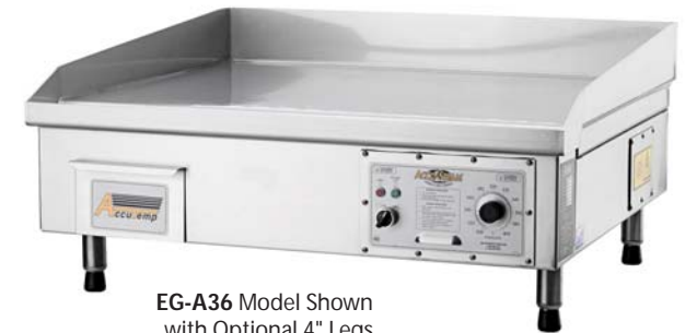
EG-A36 Model Shown with Optional 4" Legs