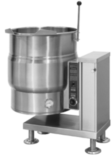
ACEC-20T Model Shown