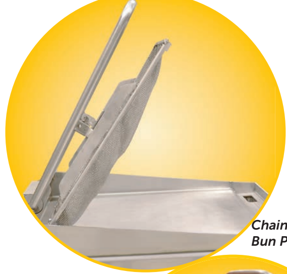
Chain Mail Bun Press