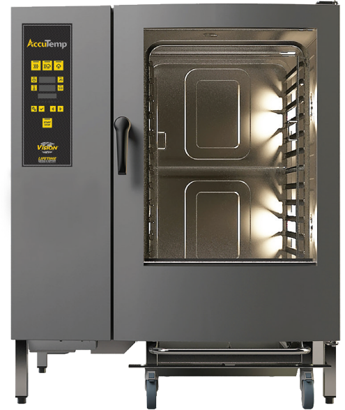
V1221IE Model shown