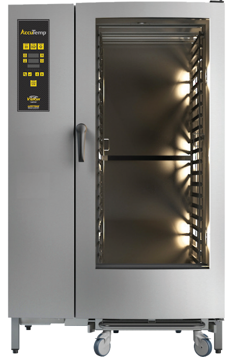
V2021IE Model Shown