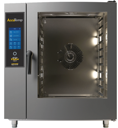
T1011IE Model shown

Combi oven shall be AccuTemp model T1011IE Vision™ Touch Series with Advanced Steam Injection System with built in heat exchanger. Constructed of heavy duty #304 stainless steel with heavy duty 2" insulation and triple-pane, tempered, curved glass door, right hinged standard. Operation modes include: steam, hot air, combination, and proofing with Golden Touch finishing feature. Vision™ Touch includes My Vision™ customizable control panel, Active Humidity Control with 0-100% humidity levels, Automatic Capacity Manager, 7 speed auto-reversing fan, patented Flap Valve, multi-point probe, multi-rack timers, preheat and auto-cool down, automatic fan stop, and Multi-Tasking function. Automatic cleaning cycle with 5 cleaning levels and hand shower. Service Diagnostic System, for unit check-up, service, and troubleshooting, USB port, and HACCP data records. Ecologix technology for lower energy and water usage.