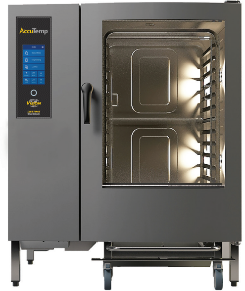
T1221IE Model shown

Combi oven shall be AccuTemp model T1221IE Vision™ Touch Series with Advanced Steam Injection System with built in heat exchanger. Constructed of heavy duty #304 stainless steel with heavy duty 2” insulation and triple-pane, tempered, curved glass door, right hinged standard. Operation modes include: steam, hot air, combination, and proofing with Golden Touch finishing feature. Vision™ Touch includes My Vision™ customizable control panel, Active Humidity Control with 0-100% humidity levels, Automatic Capacity Manager, 7 speed auto-reversing fan, patented Flap Valve, multi-point probe, multi-rack timers, preheat and auto-cool down, automatic fan stop, and Multi-Tasking function. Automatic cleaning cycle with 5 cleaning levels and hand shower. Service Diagnostic System, for unit check-up, service, and troubleshooting, USB port, and HACCP data records. Ecologix technology for lower energy and water usage.