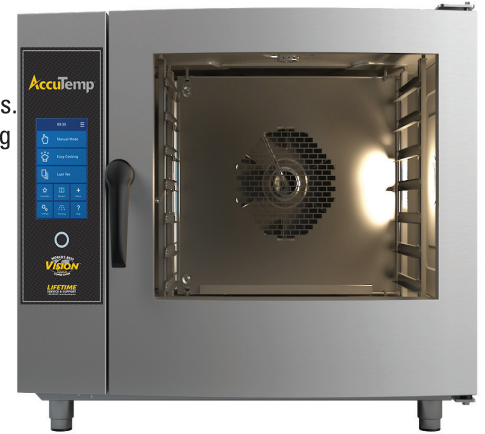
T0611IN Model shown

Combi oven shall be AccuTemp model T0611IN Vision™ Touch Series with Advanced Steam Injection System with built in heat exchanger. Constructed of heavy duty #304 stainless steel with heavy duty 2" insulation and triple-pane, tempered, curved glass door, right hinged standard. Operation modes include: steam, hot air, combination, and proofing with Golden Touch finishing feature. Vision™ Touch includes My Vision™ customizable control panel, Active Humidity Control with 0-100% humidity levels, Automatic Capacity Manager, 7 speed auto-reversing fan, patented Flap Valve, multi-point probe, multi-rack timers, preheat and auto-cool down, automatic fan stop, and Multi-Tasking function. Automatic cleaning cycle with 5 cleaning levels and hand shower. Service Diagnostic System, for unit check-up, service, and troubleshooting, USB port, and HACCP data records. Ecologix technology for lower energy and water usage.