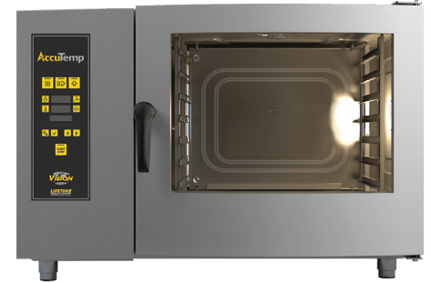
V06211E Model Shown