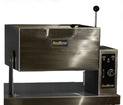
MODEL ALRES-13 shown