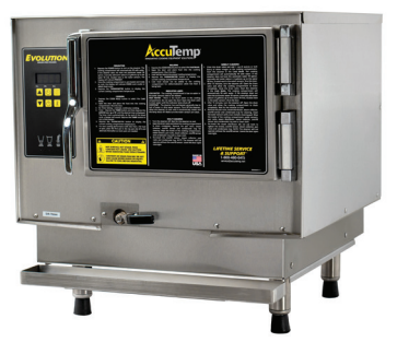
N3 Evolution™ Model shown with optional bullet feet

Evolution<sup>™</sup> steamer is AccuTemp Products' connected, boiler-free steam cooker that utilizes AccuTemp's Patented Steam Vector Technology for faster cook times, improved energy efficiency, better pan to pan uniformity, and less water consumption. Steam Vector Technology requires no moving parts inside the cooking chamber. Steam to be produced inside the cooking cavity with no heating components exposed to water. Unit to be powered by a Heavy Duty Stainless Steel Blue Flame Power burner, Easily connects to water, drain & gas lines. Uses less than 1 gallon of water per hour. Unit to include low water, high water, overtemp warning lights and auto shut off feature. Evolution™ to include heavy duty, field reversible door. Standard digital controls with independent timer. No water quality exclusions to warranty and no water filtration or treatment required. Unit to be UL Safety and Sanitation Certified. Built in USA.