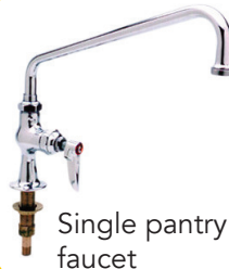
Single pantry faucet