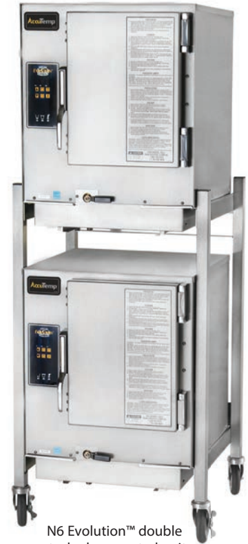
N6 Evolution™ double stacked connected unit mounted on a stainless steel stand with casters

Evolution™ steamer is AccuTemp Products' connected, boilerless steam cooker that utilizes AccuTemp's Patent Pending Steam Vector Technology for faster cook times, improved energy efficiency, better pan to pan uniformity, and less water consumption. Steam Vector Technology requires no moving parts inside the cooking chamber. Steam to be produced inside the cooking cavity with no heating components exposed to water. Unit to be powered by a Heavy Duty Stainless Steel Blue Flame Power burner, Easily connects to water, drain & gas lines. Uses less than 1 gallon of water per hour. Unit to include low water, high water, overtemp warning lights and auto shut off feature. Evolution™ to include heavy duty, field reversible door. Standard digital controls with independent timer. No water quality exclusions to warranty and no water filtration or treatment required. Units to be mounted on a stainless steel support stand. Unit to be UL Safety and Sanitation Certified, and Energy Star qualified. Built in USA.