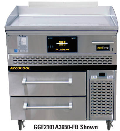
GGF2101A3650-FB Shown 36" griddle on Freezer Base