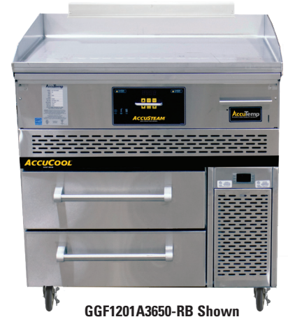
GGF1201A3650-RB Shown 36" griddle on Refrigerated Base