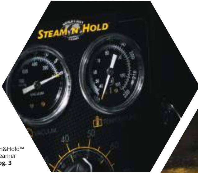
Steam&Hold™ Steamer pg. 3