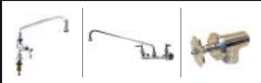
single pantry faucet