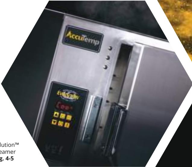
Evolution™ Steamer pg. 4-5