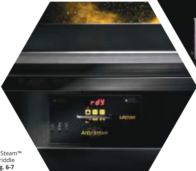
AccuSteam™ Griddle pg. 6-7