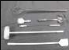
kettle brush cleaning kit

Customize the Edge™ Series Kettle to make cooking (and cleaning) easier. AccuTemp offers single and double pantry faucets, a kettle brush cleaning kit, and triple perforated SS baskets.