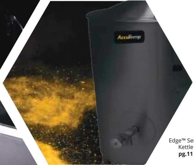
Edge™ Series Kettle pg.11