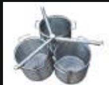
triple perforated SS baskets