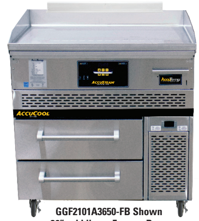
GGF2101A3650-FB Shown 36" griddle on Freezer Base