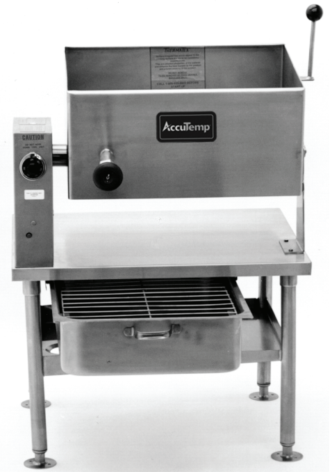
MODEL ALRES-13 shown with optional stand